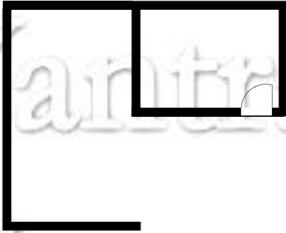
House 1 - First Floor