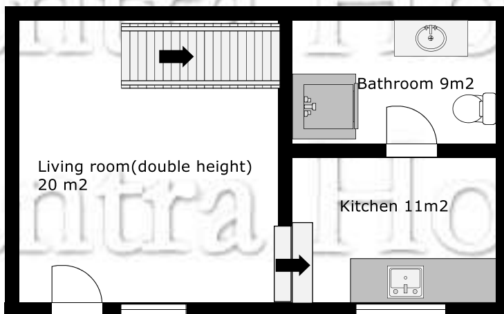
Annex Lower Floor